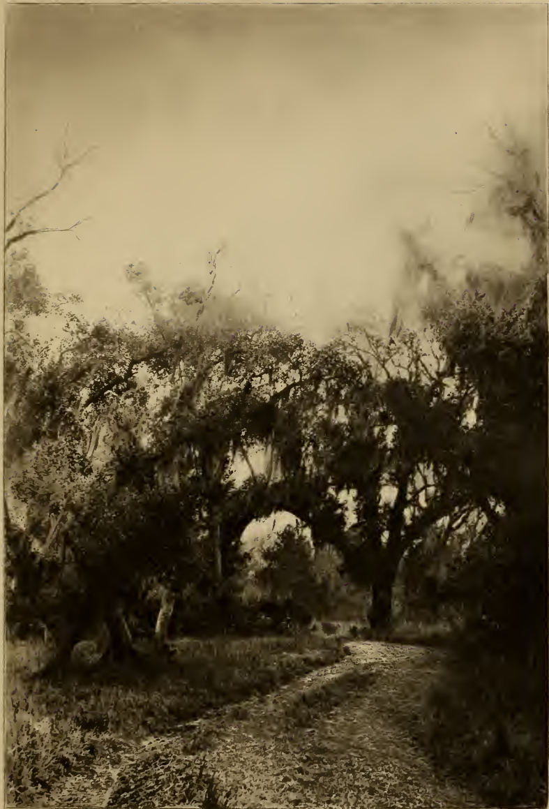
TURN IN OGLETHORP ROAD